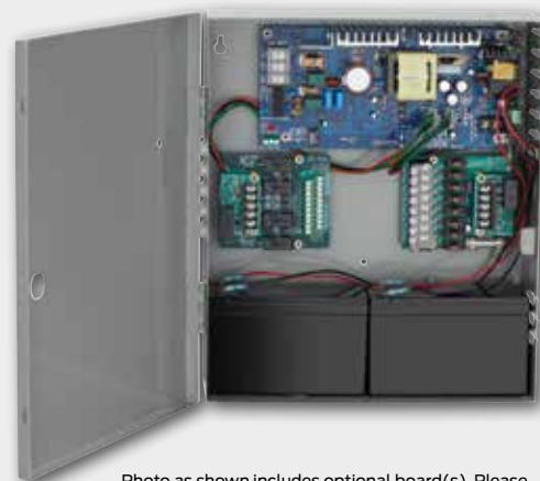
Photo as shown includes optional board(s). Please contact your local sales office or visit the support section on our website for configuration assistance.