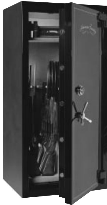
RSA6030 Gun Safe