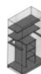
6040/7420 Series 26 Gun