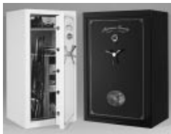
Classic Series Models 6030 and 6040