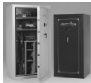
American Series Models 7240-26 and 6030