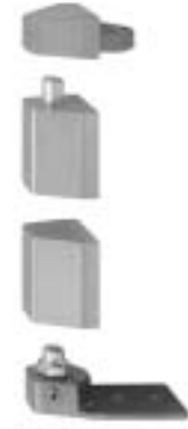
Set No. J-27* Set No. J-28**