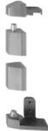
Set No. J-43*