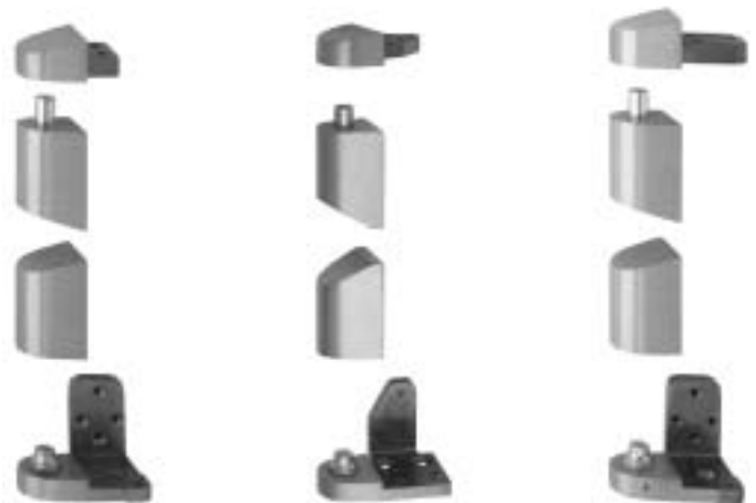
Set No. J-34*