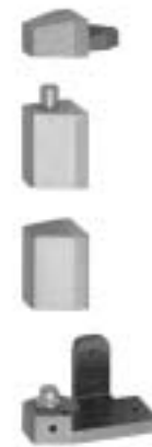
Set No. J-30* Set No. J-31**